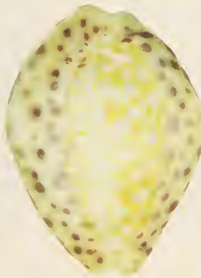
Figure 2 b